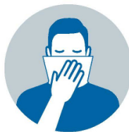
Cover mouth/nose with a tissue or sleeve when coughing or sneezing