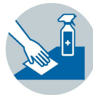
Clean and disinfect frequently touched objects and surfaces