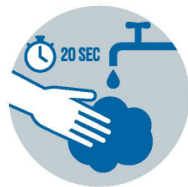
Wash hands often