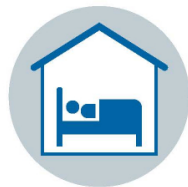
Stay home while you are sick; avoid others