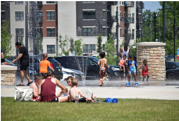
Families gathered for picnic lunches and children got a break from the heat Tuesday at the splash pad in Panton Mill Park in South Elgin.

For a full list of cooling centers in Kane County, go to cityofelgin.org/staycool .