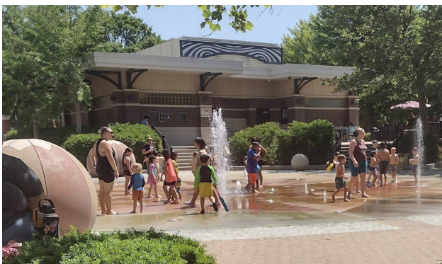
Families gathered at the splash pad in downtown Elgin's Festival

"We'll probably get some popsicles and ice cream later to keep cool," the South Elgin mom said.